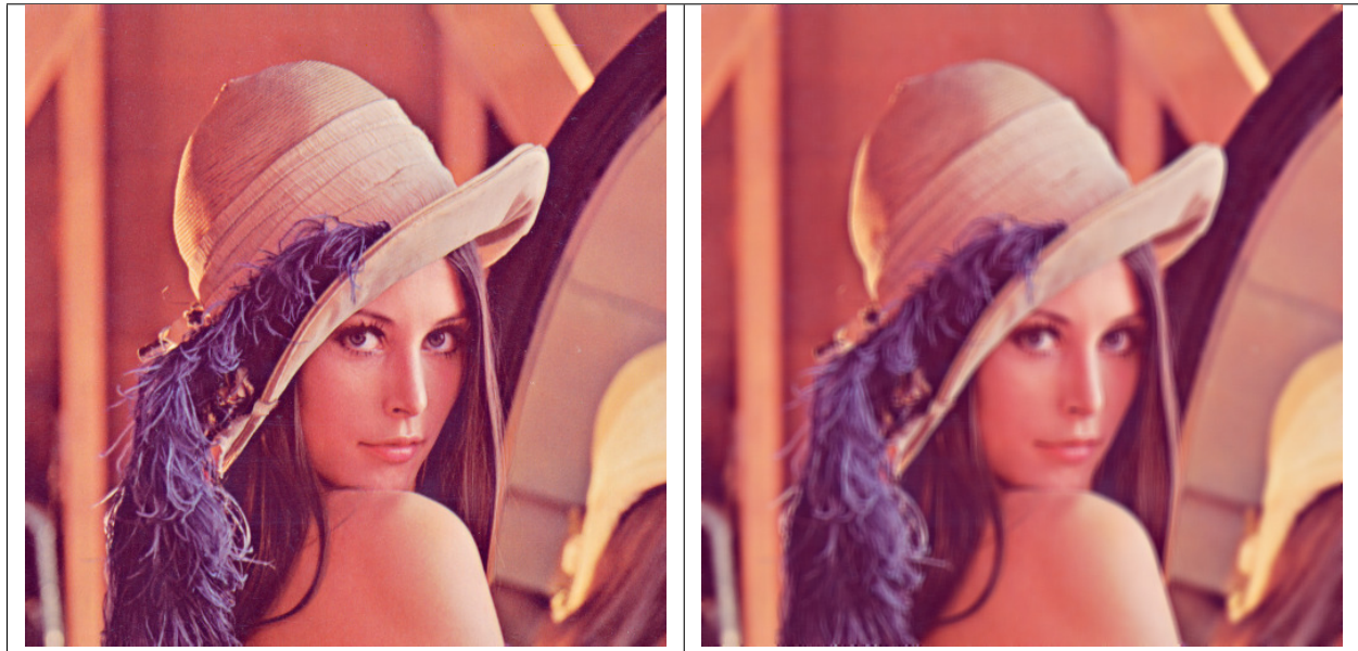
Table 1: Blur image workflow

output = girder_worker.tasks.run( wf, inputs={ 'blur_input': lenna, 'blur_radius': {'format': 'number', 'data': 5} } )