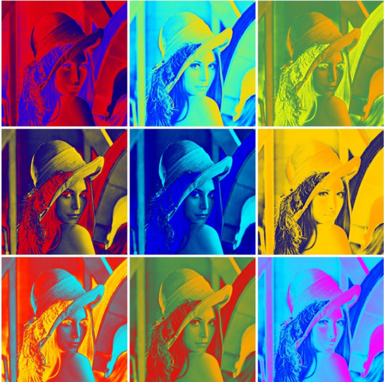
Fig. 2: Warholized version of Lena