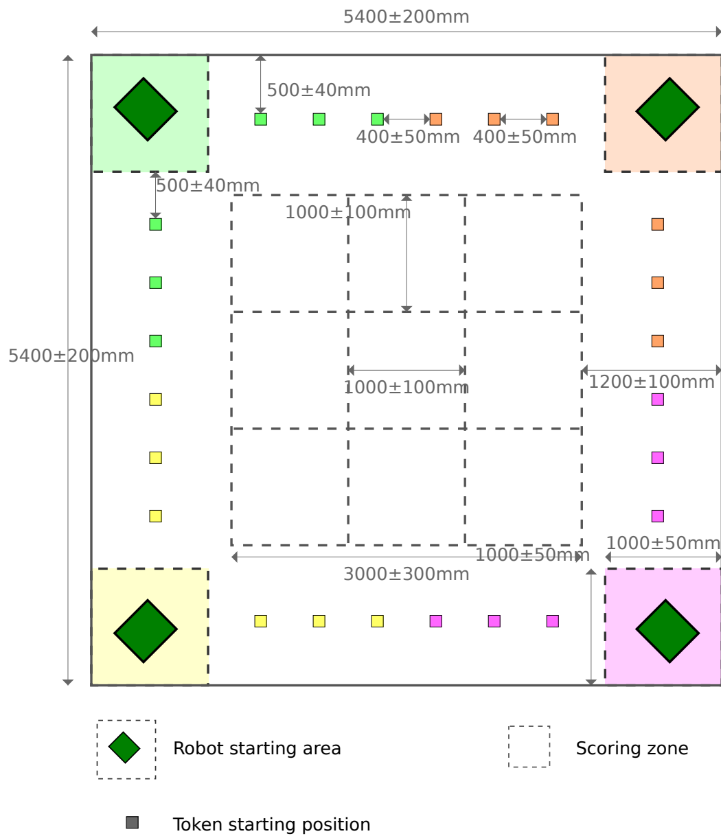
Figure 1: Layout zones and tokens in the arena.